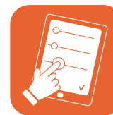
User-Friendly Web Interface