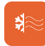
Natural Heat Convection