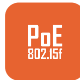
Power over Ethernet