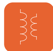
Galvanically Isolated Ports