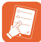
User-Friendly Web Interface