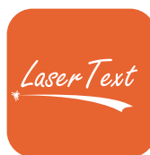
Permanent Laser Engraving