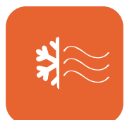
Natural Heat Convection