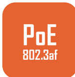
Power over Ethernet